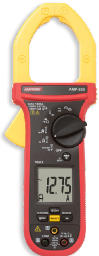
AMP-330 AC/DC 1000 A Clamp Meter Industrial Motor Maintenance