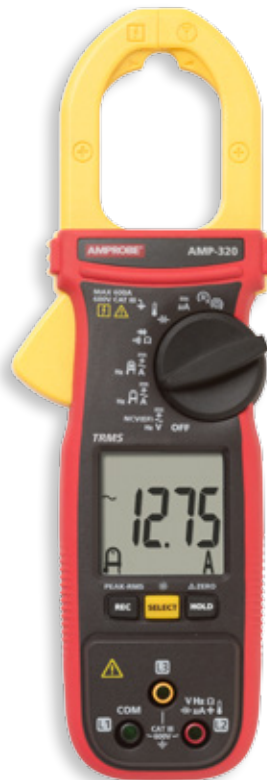
AMP-320 AC/DC Clamp Meter Electrical Motor Maintenance