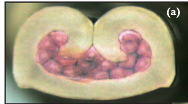
Cross Sections Showing Minimum (a) and Maximum (b) Area Index per Terminal Specification—a Variation of \pm 3.5\%

Therefore, varying the CW by 2% would result in a CH variation of 2%, or 0.0014 in. At a CH tolerance of \pm 0.002 in, 35% of the total CH tolerance would be used by a 2% variation in CW. Thus, the importance of crimp width control is obvious when tooling is changed during a production run.