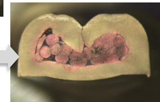
Visible deformation of outer crimp surface because of indentation from material buildup on crimper.

Chromium plating has the ability to be applied uniformly and consistently and exhibits excellent adhesion to the base metals. The unique benefits of chromium plating, such as ease of application, consistency of plating, adhesion to base metal, extremely low coefficient of friction, very high hardness, and resistance to adhesion, make it truly difficult to match in crimp performance and durability. However many alternative coatings are being attempted, and some show excellent promise in specific applications.