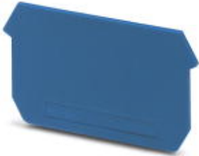
End cover, Length: 63.5 mm, Width: 1.5 mm, Color: blue

Please be informed that the data shown in this PDF Document is generated from our Online Catalog. Please find the complete data in the user's documentation. Our General Terms of Use for Downloads are valid ( http://phoenixcontact.com/download )