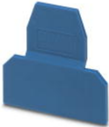
End cover, Length: 56 mm, Width: 2.5 mm, Height: 62 mm, Color: blue

Please be informed that the data shown in this PDF Document is generated from our Online Catalog. Please find the complete data in the user's documentation. Our General Terms of Use for Downloads are valid ( http://phoenixcontact.com/download )