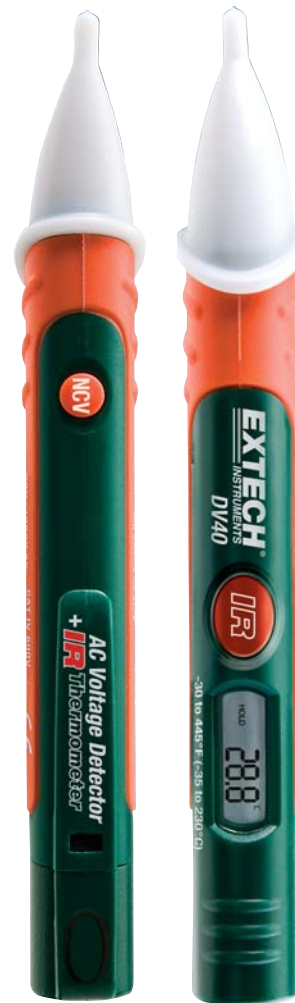
Non-Contact AC Voltage Detector