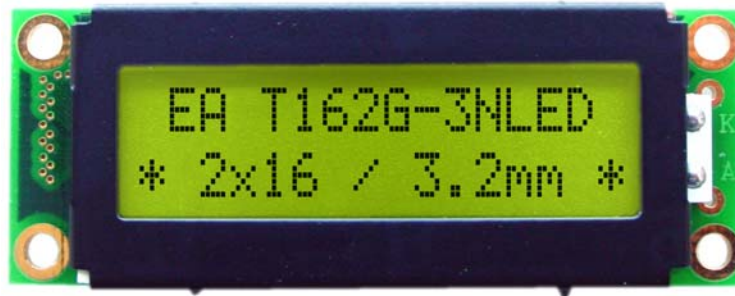
Abmessungen: 53 x 20 mm