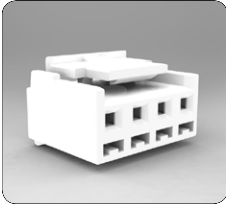
EP II 4-Posn Retainer Housing with Latch and Tabs, part number 2132781-4