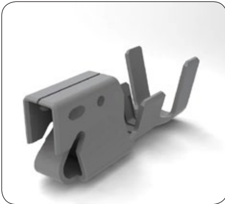
EP II Phos Bronze Pre-Tin Contact 18-22 AWG, part number 1744144-1