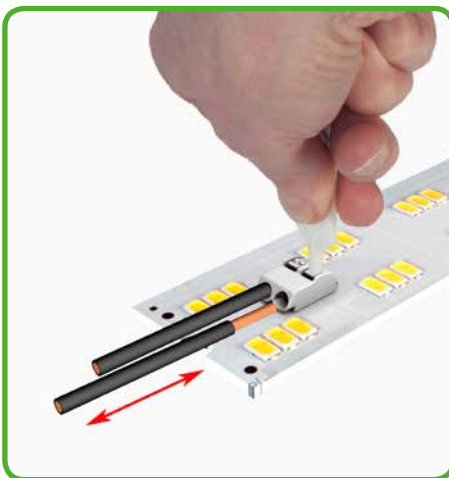
Inserting/removing fine-stranded conductors by lightly pressing on push-button.