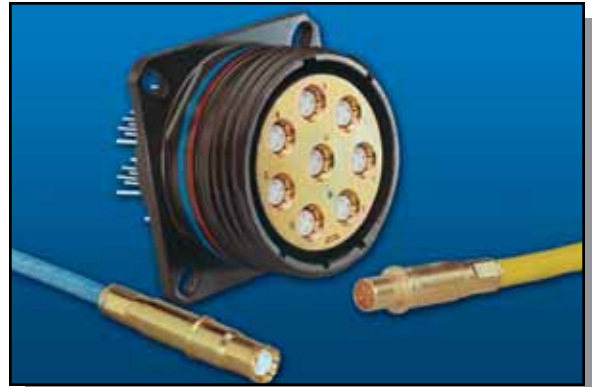
D38999 Series III Groundplane Connector with Quadrax PCB Sockets Installed Contacts front are Differential Twinax (left) and Quadrax (right)