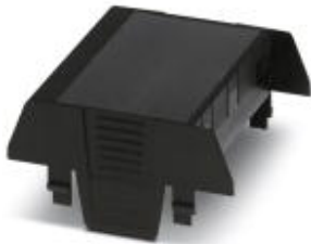
Component housing, connection opening on one side, Upper part, color: black, width: 67.5 mm

Please be informed that the data shown in this PDF Document is generated from our Online Catalog. Please find the complete data in the user's documentation. Our General Terms of Use for Downloads are valid ( http://phoenixcontact.com/download )