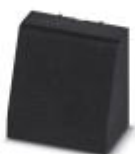
Component housing, color: black, width: 22.5 mm

Filler plugs - EH 22,5-FP/ABS BK9005 - 2201842