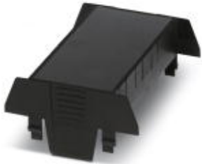
Component housing, connection opening on both sides, Upper part, color: black, width: 90 mm

Please be informed that the data shown in this PDF Document is generated from our Online Catalog. Please find the complete data in the user's documentation. Our General Terms of Use for Downloads are valid ( http://phoenixcontact.com/download )