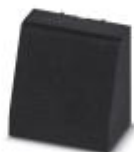
Component housing, color: black, width: 22.5 mm

Filler plugs - EH 22,5-FP/ABS BK9005 - 2201842