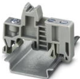
End clamp, Width: 9.5 mm, Height: 35.3 mm, Length: 50.5 mm, Color: gray

Please be informed that the data shown in this PDF Document is generated from our Online Catalog. Please find the complete data in the user's documentation. Our General Terms of Use for Downloads are valid ( http://phoenixcontact.com/download )