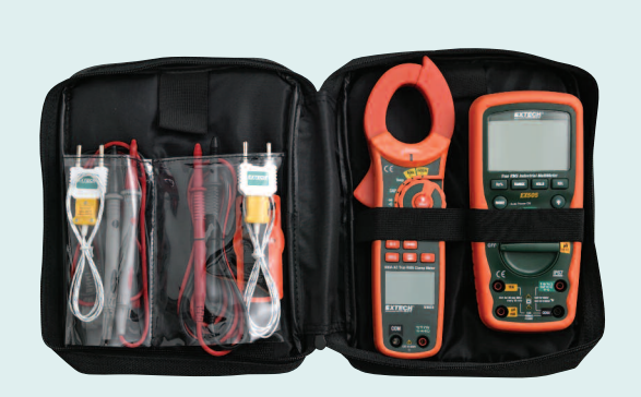
Large soft case conveniently fits meters and accessories for easy storage and transportation.