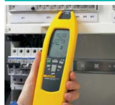
Location of fuses/breakers and assignment to circuits