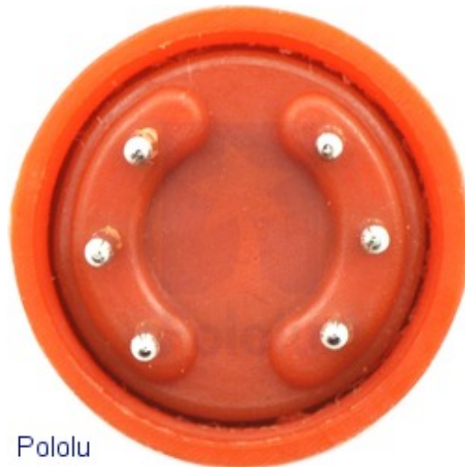
Gas sensor with orange plastic case bottom view.

This Carbon Monoxide (CO) and flammable gas sensor detects the concentrations of CO and combustible gas in the air and outputs its reading as an analog voltage. The sensor can measure concentrations of CO from 10 to 1,000 ppm and flammable gas from 100 to 10,000 ppm. The sensor can operate at temperatures from -10 to 50°C and consumes less than 150 mA at 5 V. Please read the MQ9 datasheet (180k pdf) for more information about the sensor.