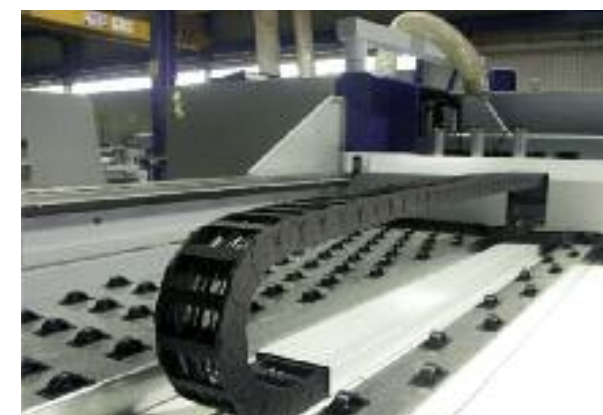
chainflex® CF130.UL for woodworking. e-chain®: E4/light