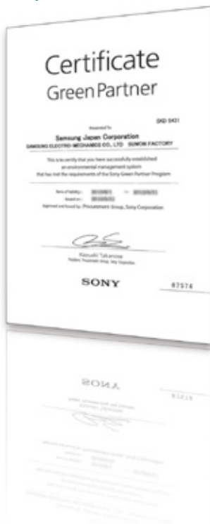
Sony Green Partner