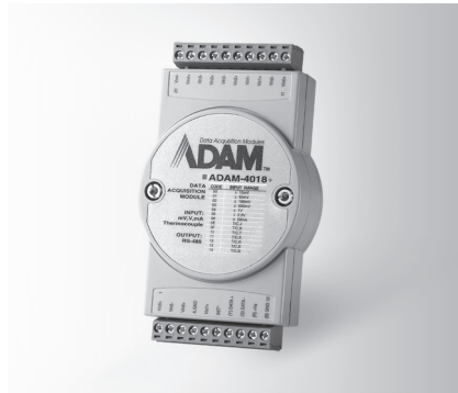
ADAM-4018+ FCC CE RoHS LISTED E190861 ETC.