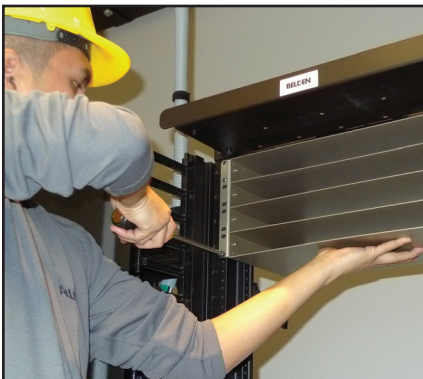
A single installer can install the system.

A standard sliding module tray brings the work platform out of the rack and at a 23 degree tilt down toward the installer to improve accessibility during installation. A quickly installed lid and front patch cord tray provides unprecedented visibility to the work at hand. Improved accessibility and visibility leads to fast, clean, error-free installation.