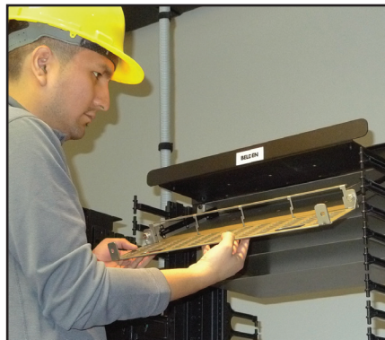
Slide-in trays tilt outward to improve accessibility.