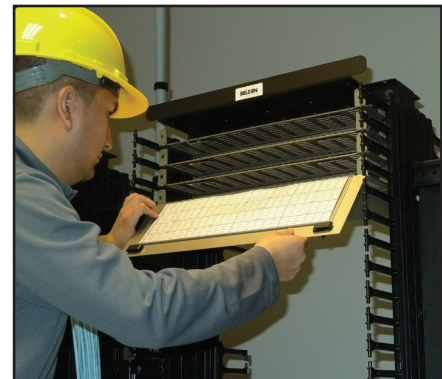
Shelf identification labeling is clearly visible.