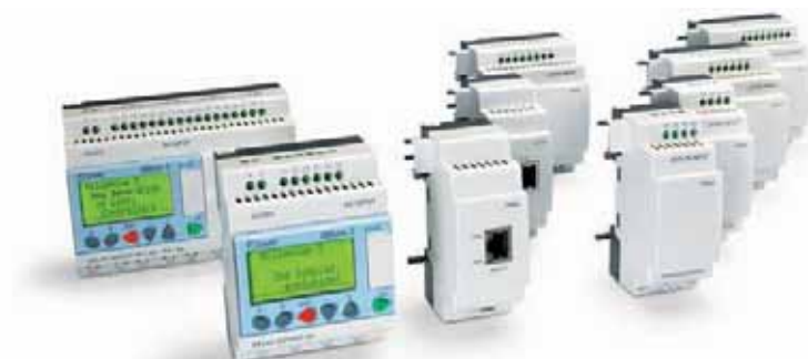
Millenium 3 range