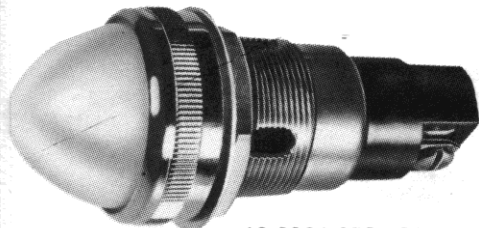
19-0901-0531-301 Large Torpedo lens