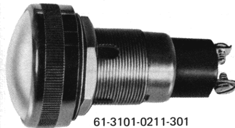
61-3101-0211-301 Large Convex lens