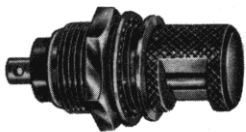
4-1930-2900-201 (without filter)