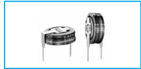
Marking color : White print on an indigo sleeve