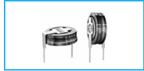
Marking color : White print on an indigo sleeve