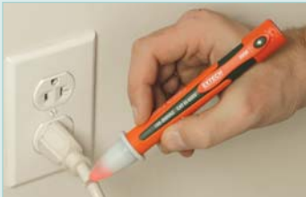
Quickly check for the presence of live wires before testing