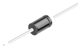
DO-35 Glass case