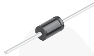
DO-41 (Plastic) COLOR BAND DENOTES CATHODE