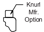
Sym. A Socket Head