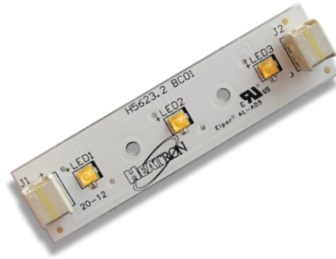
Linear 3 LED Array