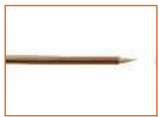
1. A sharpened dowel pin is selected—slightly smaller than the wire diameter