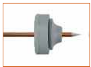
2. The dowel pin is inserted into the opening on the front of the LTB and pushed through the membrane