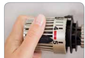
Figure 6. Thermostat