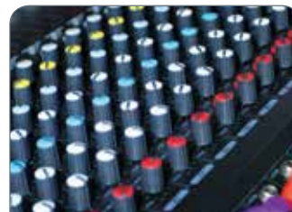
Figure 1. Sound mixer