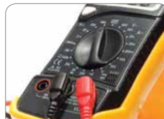
Figure 3. Multimeter