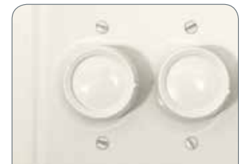
Figure 2. Light switches