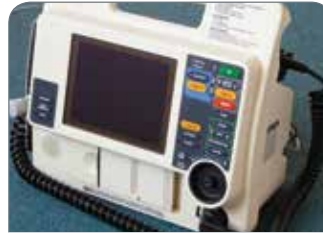
Figure 7. Portable defibrillator