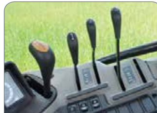
Figure 9. Joysticks