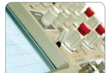
Figure 4. Oscilloscope