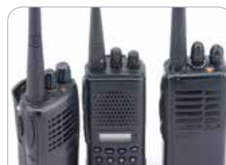
Figure 5. Walkie-talkies