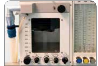
Figure 8. Diagnostic equipment