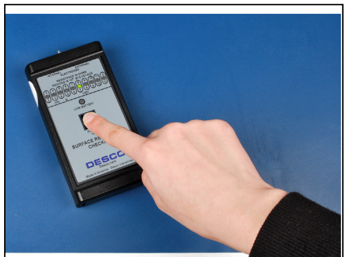
Figure 3. Using the internal parallel electrodes to measure surface resistance

Note: For worksurfaces, use Desco Item# 10435 Reztore™ Antistatic Surface and Mat Cleaner or other silicone-free ESD cleaner. Be sure the surface is dry before testing.