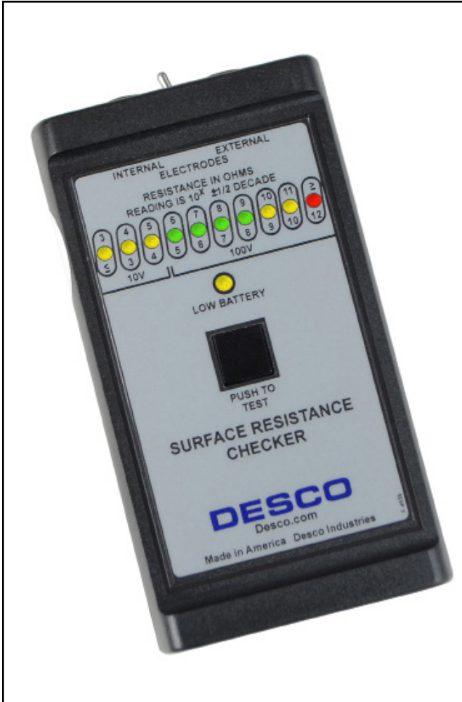
Figure 1. Desco 19640 Surface Resistance Checker