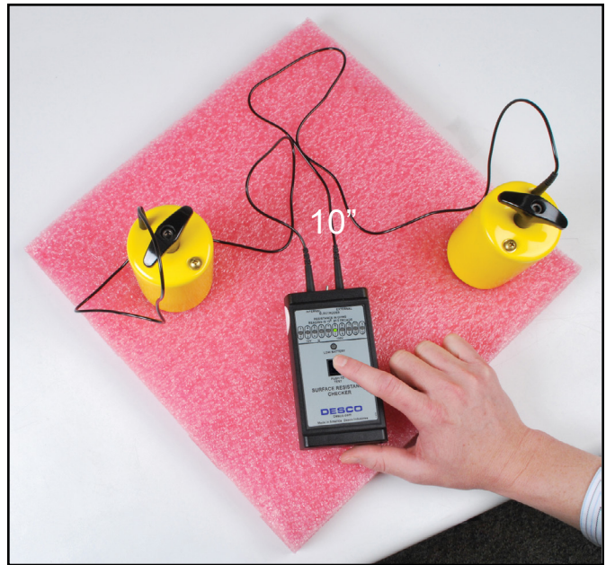
Figure 4. Using the test leads and two 5 pound electrodes to measure Rtt