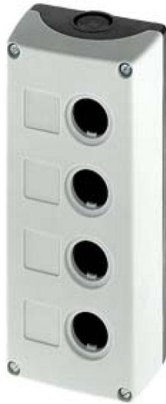
ENCLOSURE FOR 22MM PROGRAM PLASTIC VERSION 4 COMMAND POSITIONS GRAY TOP PART