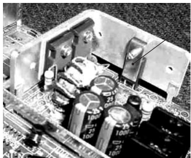
TK/TN mounted vertically