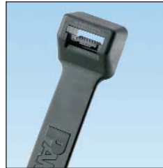
No Buckle Design