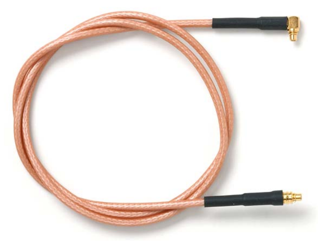
Model 73064 MMCX Plug to Right-Angle MMCX Plug, RG316/U