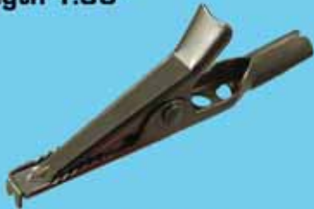
Alligator Clip, Steel, Fang Tooth with Barrel