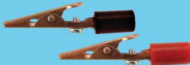
Alligator Clip, Solid Copper, with Barrel, Screw & Handle, 10 Amp