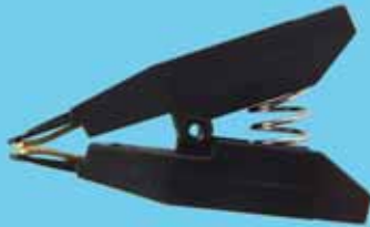
Insulated Kelvin Clip, 10 Amp