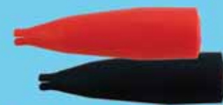
Insulator for 502008 Series