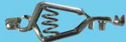
Analyzer Clip, Steel, 10 Amp