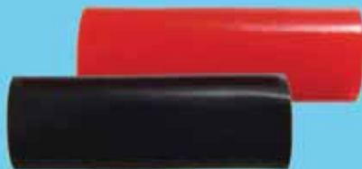
Insulator for the 501774 Series, {2 Req'd per clip}