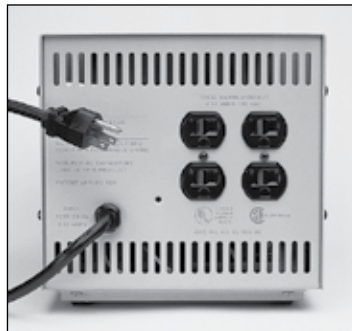
60 Hz, 70 – 1000 VA, (4) 5-15R Receptacles