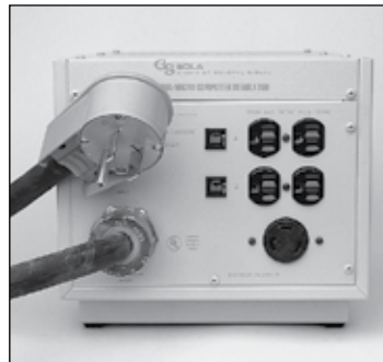
60 Hz, 2000–3000 VA, (4) 5-15R and (1) L5-30R Receptacle