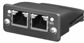
Active - (Industrial Ethernet)