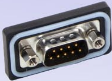
Panel Mount (DCPDB09MSC1)