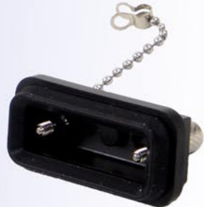
Connector Cap (DBSCAP)