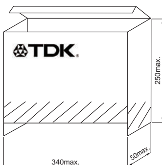
Dimensions in mm

⚠ Please be sure to request delivery specifications that provide further details on the features and specifications of the products for proper and safe use. Please note that the contents may change without any prior notice due to reasons such as upgrading.