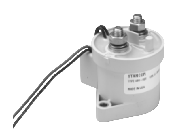
Typical applications include battery switching and back-up, DC voltage power control, circuit protection and safety.