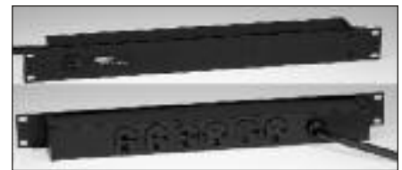
J06B0B20X (Front & Back)