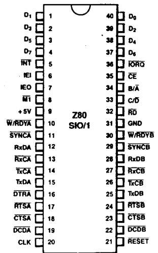
Figure 4. 40-pin Dual-In-Line Package (DIP), Pin Assignments

Note: Power connections follow conventional descriptions below: