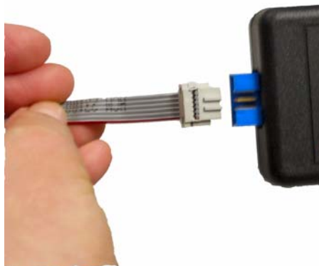
Figure 2. Connecting the Six-Conductor Ribbon Cable to the Serial or USB Smart Cable

After installing the USB Smart Cable, connect the power supply to the development board at connector J7, and then to an electrical outlet. The Green 3.3 V DC LED illuminates indicating that power is supplied to the board.